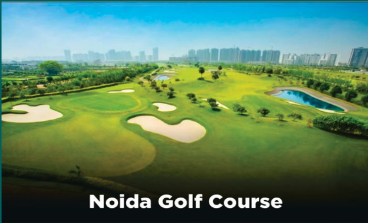
Noida Golf Course